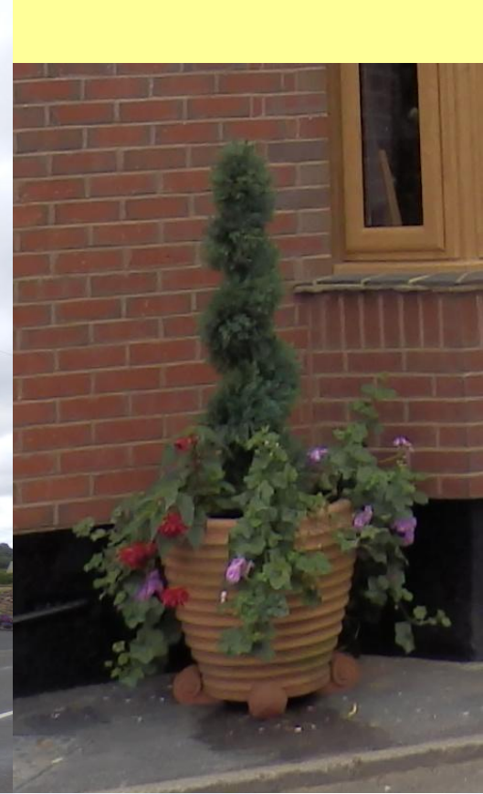
After months behind scaffolding the Shropshire emerges with a new look.