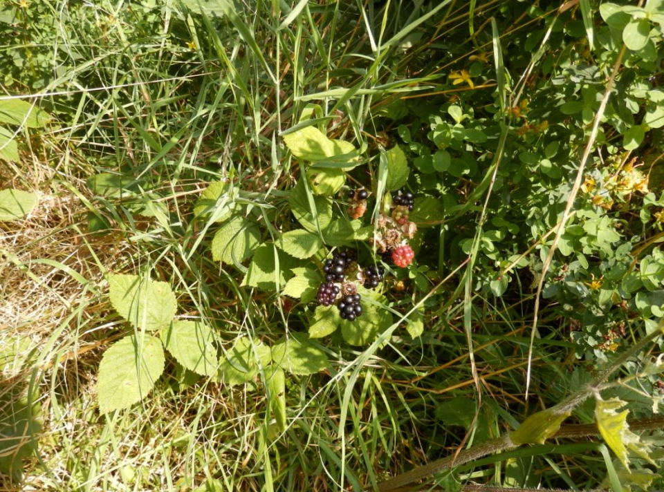
Flowers, seeds and berries on the Greenway